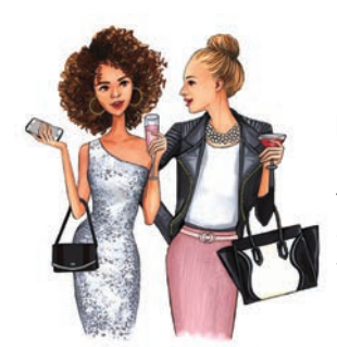
Power of the Purse

United Way of Greater New Bedford hosts three signature fundraisers to support our work in the community. Each event has a unique look and feel and engage support at all levels.